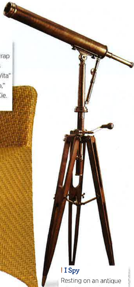
| I Spy Resting on an antique tripod base, this brass beauty with a 12x lens was inspired by a 19th-century French telescope, $2,995. (restorationhardware.com)