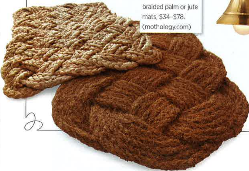
| Welcome Home Before entering, wipe your paws on these handsome braided palm or jute mats, $34-$78. (mothology.com)