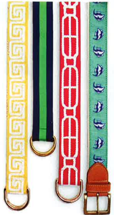
Canvas and ribbon belts $20-$58 jmclaughlin.com