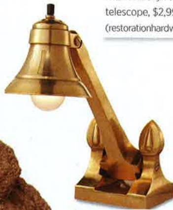
| Top Brass Reminiscent of a ship's bell, the "Wellfleet" task lamp is a sturdy little light that throws a generous glow, $990. (ralphlaurenhome.com)