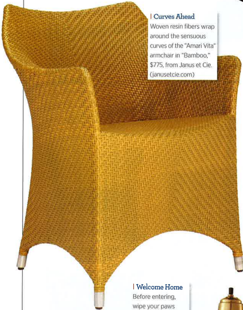
| Curves Ahead Woven resin fibers wrap around the sensuous curves of the "Amari Vita" armchair in "Bamboo," $775, from Janus et Cie. (janusetcie.com)