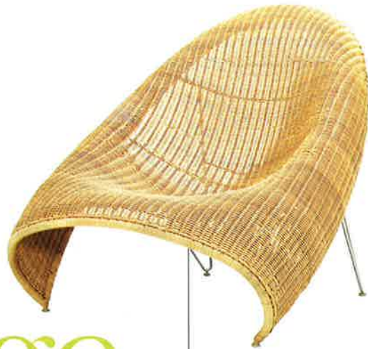
Timeless with a twist, the Fibonacci Alba chair by Janus et Cie features a classic wicker weave and dramatic curves. $2,210, janusetcie.com