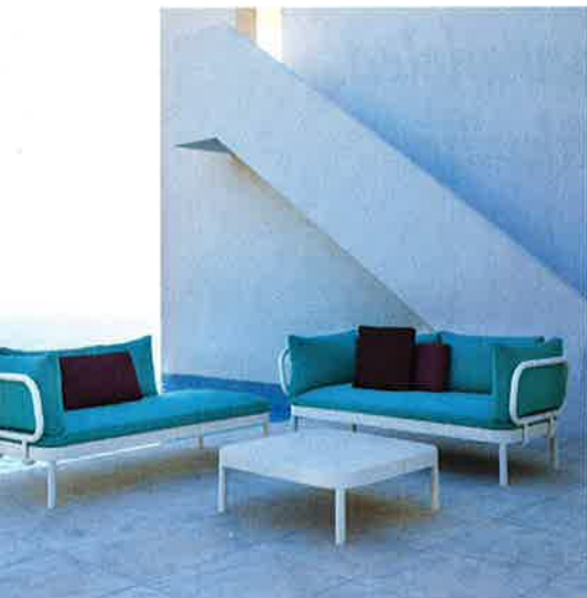
Tennis rackets of the 1920s and '30s inspired the elegantly shaped aluminum frame and cushions of Gandia Blasco's St. Tropez sofa, by Munich-based Stelan Diez. $6,330, gandiabrasco.com

When it comes to poolside decor, bigger is better. Sculptural loungers, oversized fire pits and bold colours make for a patio with all the stylish sophistication of a five-star resort BY MATTHEW HAGUE