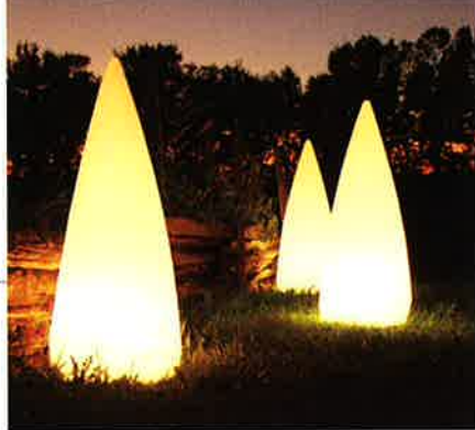
For an ethereal presence after dark, Twist Production's Mia Serata lanterns come in three-, five- or eight-foot versions. From $300, twistproduction.com