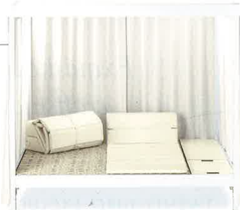
At-home cabanas are the next big thing, and Dedon's City Camp collection is the ultimate backyard escape - available as a daybed or covered garden swing. From $19,940, dedon.de