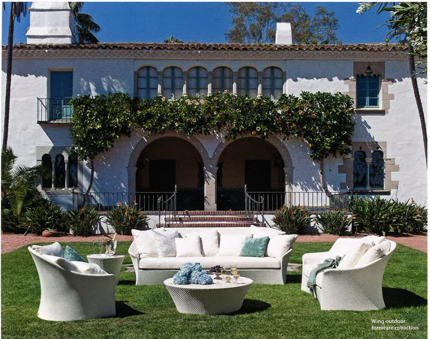
Wing outdoor furniture collection