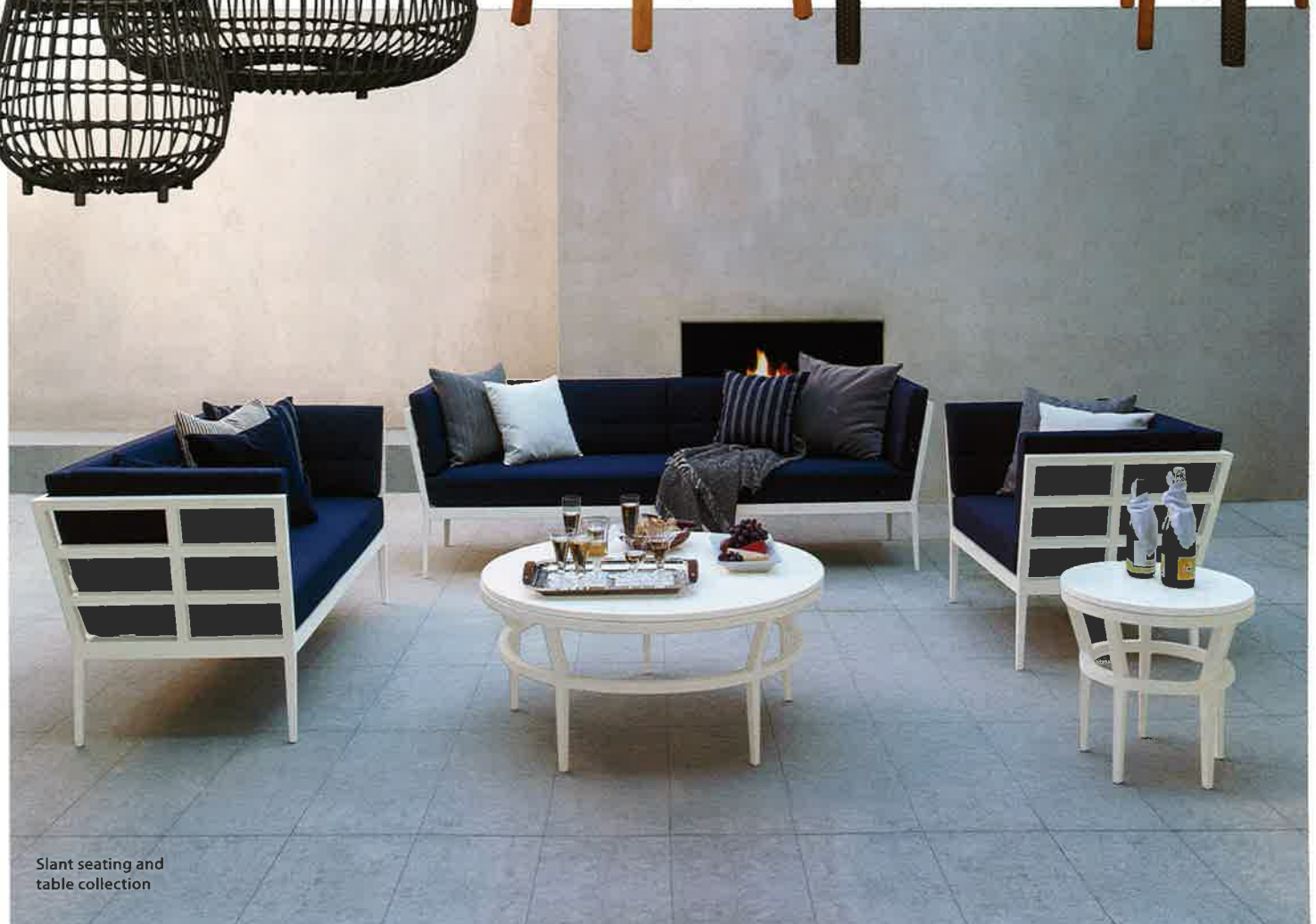
Slant seating and table collection