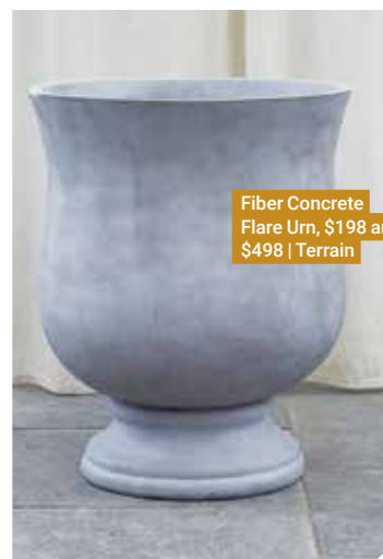
Fiber Concrete Flare Urn, $198 and $498 | Terrain