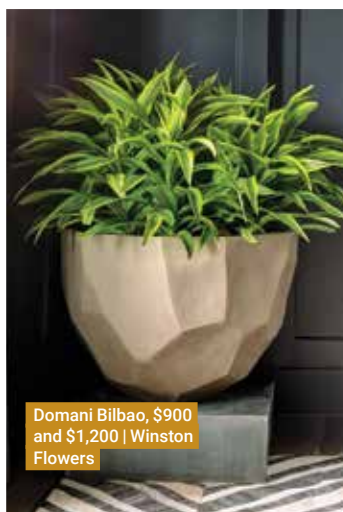
Domani Bilbao, $900 and $1,200 | Winston Flowers