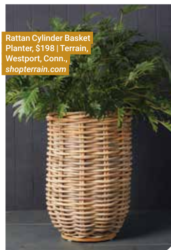
Rattan Cylinder Basket Planter, $198 | Terrain, Westport, Conn., shopterrain.com