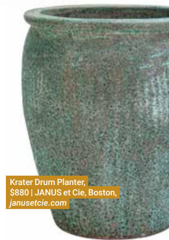
Krater Drum Planter, $880 | JANUS et Cie, Boston, janusetcie.com

Jordan's Jungle, Pawtucket, R.I., jordansjungle.net Seed to Stem, Worcester, Mass., seedtostemhome.com