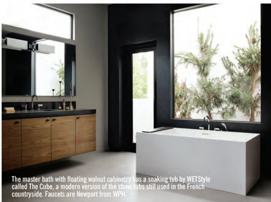
The master bath with floating walnut cabinetry has a soaking tub by WETStyle called The Cube, a modern version of the stone tubs still used in the French countryside. Faucets are Newport from WPH.