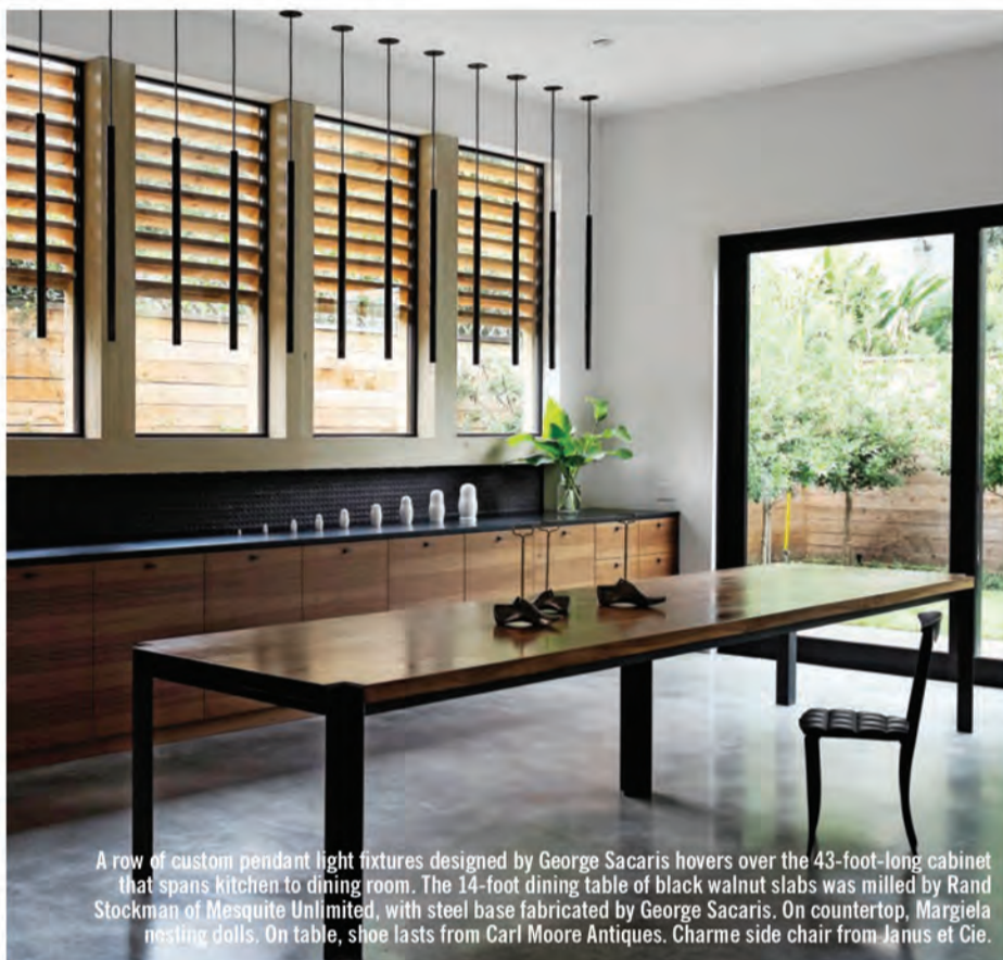
A row of custom pendant light fixtures designed by George Sacaris hovers over the 43-foot-long cabinet that spans kitchen to dining room. The 14-foot dining table of black walnut slabs was milled by Rand Stockman of Mesquite Unlimited, with steel base fabricated by George Sacaris. On countertop, Margiela nesting dolls. On table, shoe lasts from Carl Moore Antiques. Charme side chair from Janus et Cie.