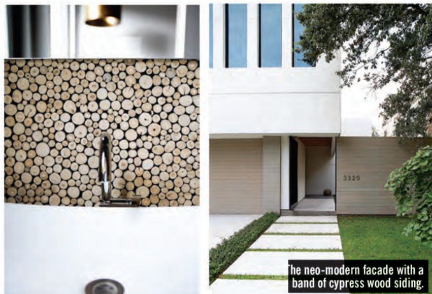
The neo-modern facade with a band of cypress wood siding.