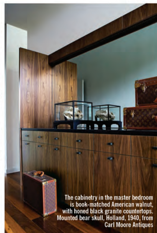
The cabinetry in the master bedroom is book-matched American walnut, with honed black granite countertops. Mounted bear skull, Holland, 1940, from Carl Moore Antiques