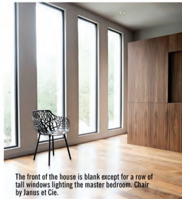
The front of the house is blank except for a row of tall windows lighting the master bedroom. Chair by Janus et Cie.