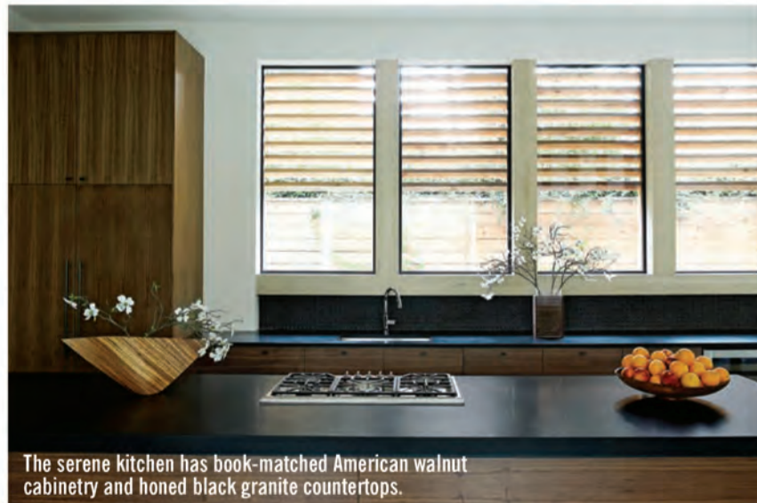
The serene kitchen has book-matched American walnut cabinetry and honed black granite countertops.