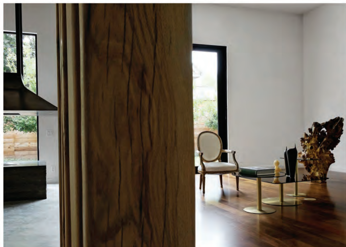
Architecturally scaled white oak pillars milled by Brian Connor of BC Woodworks in Houston, demarcate the living area from the dining area. Right: End-cut coffee wood from Horizon Italian Tile covers the walls of the powder room.