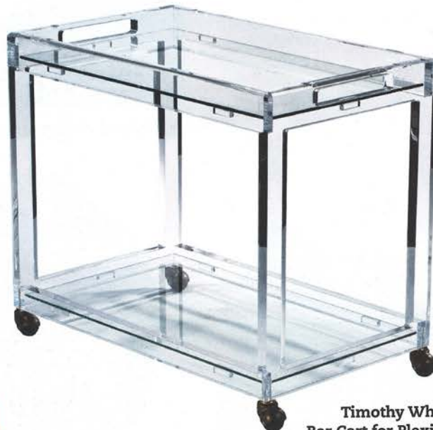
Timothy Whealon Bar Cart for Plexi-Craft

Interior designer Heather Vaughan pulls out all the stops for creating a colorful outdoor patio area with Palm Beach–chic style.