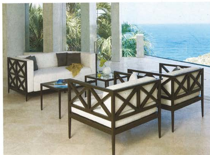
Azimuth Cross Lounge Chair

L’ArcoBaleno, (855) 808-4017, larcobaleno.com