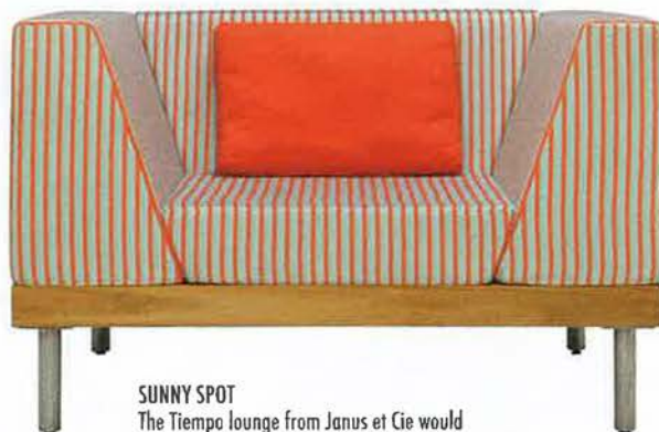
SUNNY SPOT The Tiempo lounge from Janus et Cie would be a welcome colorful addition to any patio.