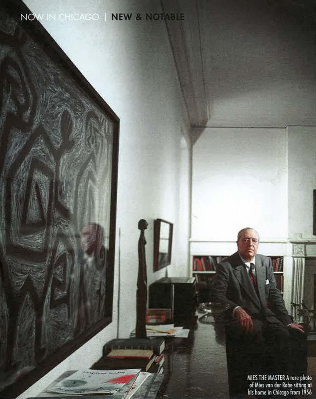
MIES THE MASTER A rare photo of Mies van der Rohe sitting at his home in Chicago from 1956