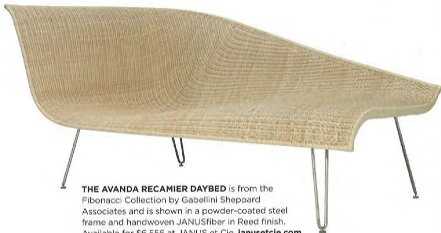
THE AVANDA RECAMIER DAYBED is from the Fibonacci Collection by Gabellini Sheppard Associates and is shown in a powder-coated steel frame and handwoven JANUSfiber in Reed finish. Available for $6,556 at JANUS et Cie. janusetcie.com