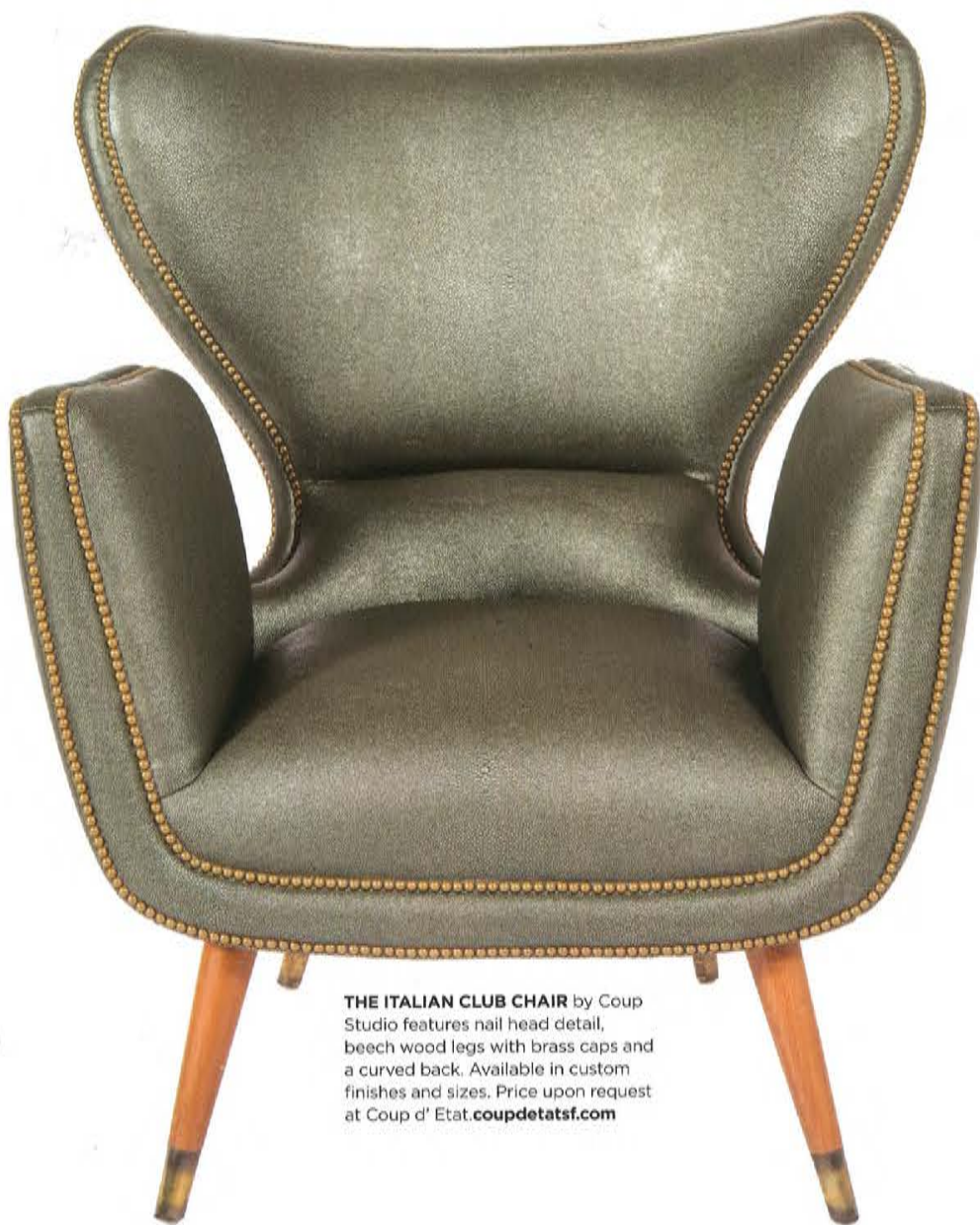
THE ITALIAN CLUB CHAIR by Coup Studio features nail head detail, beech wood legs with brass caps and a curved back. Available in custom finishes and sizes. Price upon request at Coup d'Etat. coupdetatsf.com