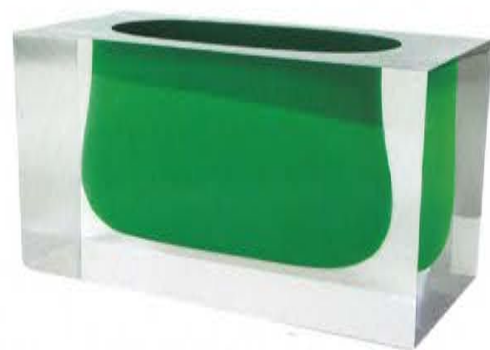
THE BEL AIR GORGE VASE is made of 100 percent Lucite; shown in Emerald. Available for $195 at Jonathan Adler. jonathanadler.com