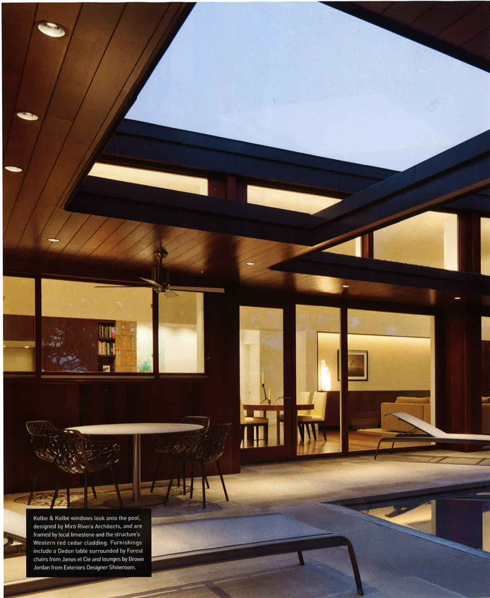
Kolbe & Kolbe windows look onto the pool, designed by Miró Rivera Architects, and are framed by local limestone and the structure's Western red cedar cladding. Furnishings include a Dedon table surrounded by Forest chairs from Janus et Cie and lounges by Brown Jordan from Exteriors Designer Showroom.