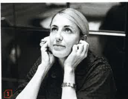
Karim Rashid for Vondom