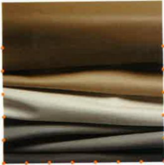
Garrett Leather 7-7054