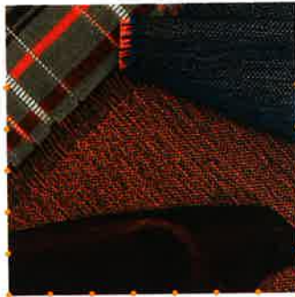
HBF Textiles 387