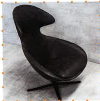
Sandler Seating 1099