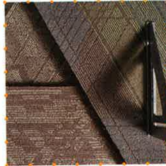
Mannington Commercial 1039