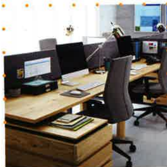
West Elm Workspace with Inscape 1191