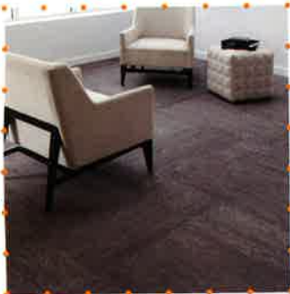
J+J Flooring Group 10-118