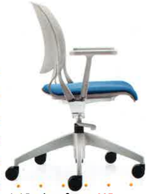
Global Furniture Group 1035