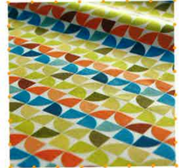
Mayer Fabrics 1173