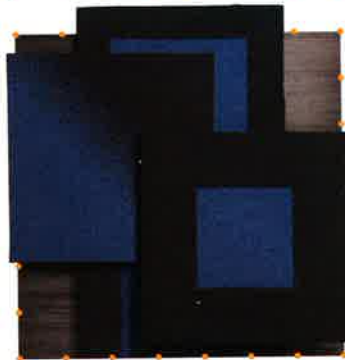
Mohawk Group 377