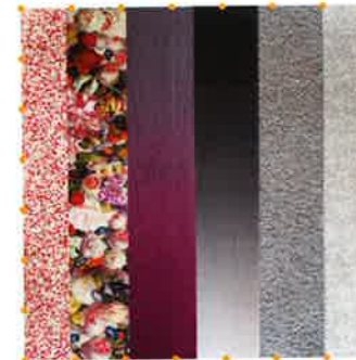
Tarkett 3-391 & 7-6130