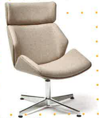
OFS Brands 1132