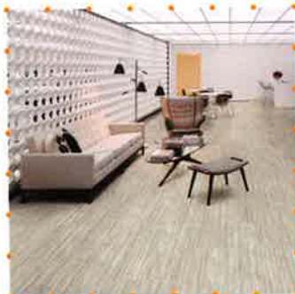
Metroflor Corporation 7-8116