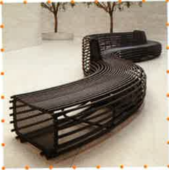
JANUS et Cie 3-107 & 1420