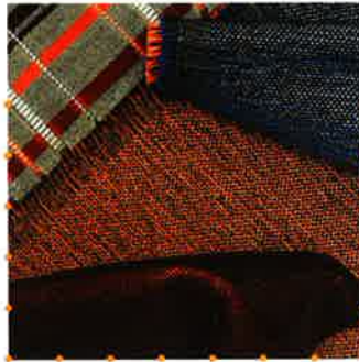
HBF Textiles 387