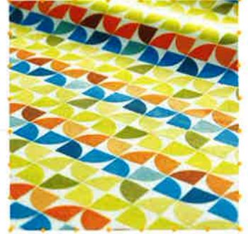
Mayer Fabrics 1173