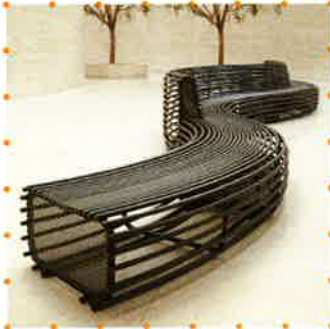
JANUS et Cie 3-107 & 1420