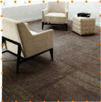
J+J Flooring Group 10-118