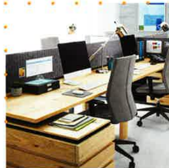
West Elm Workspace with Inscape 1191