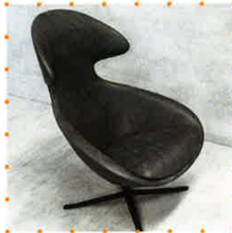
Sandler Seating 1099