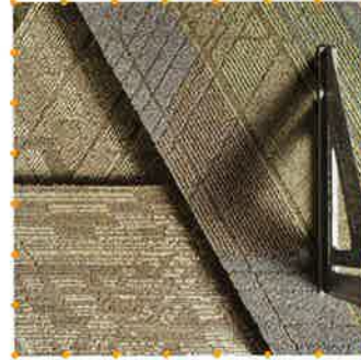
Mannington Commercial 1039