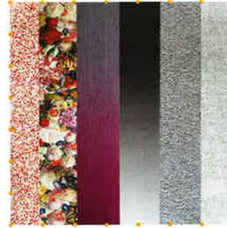
Tarkett 3-391 & 7-6130