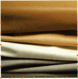
Garrett Leather 7-7054