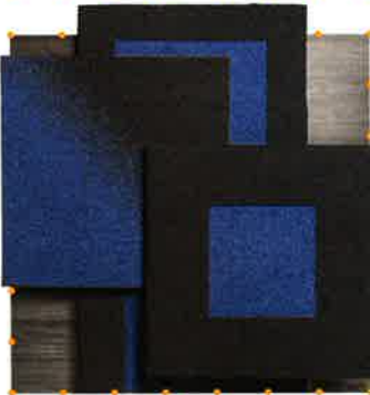
Mohawk Group 377