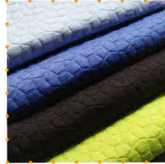
Momentum Group 11-106