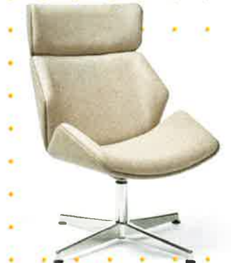
OFS Brands 1132