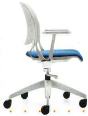
Global Furniture Group 1035