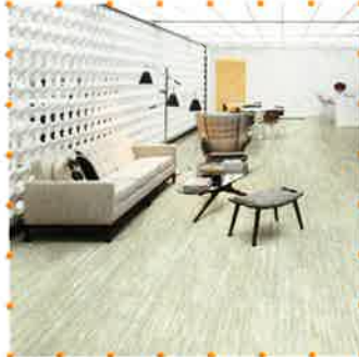
Metroflor Corporation 7-8116