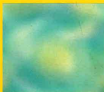
Milliken 1149 millikencarpets.com