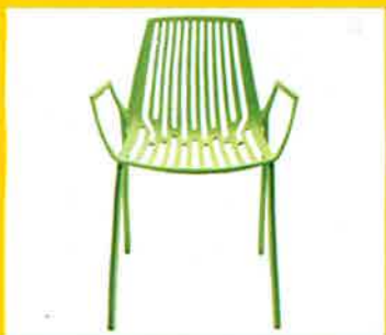
JANUS et Cie 3-107/1876 janusetcie.com