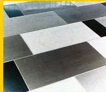
Crossville, Inc. 8-9086 crossvilleinc.com