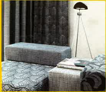
Architex 8-4072 architex-ljh.com