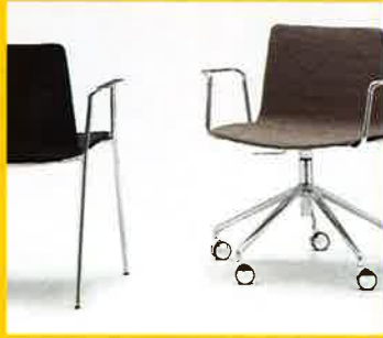
Andreu World America 10-132 andreuworldamerica.com