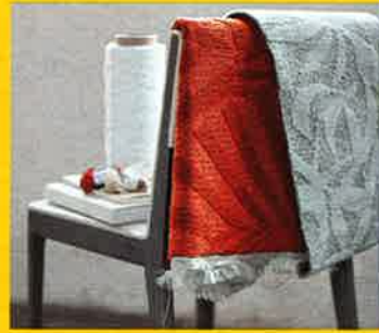
Antron®/INVISTA™ 10-111 antron.net