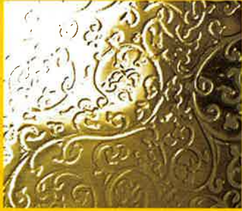
ABET LAMINATI 8-4129 abetlaminati.com