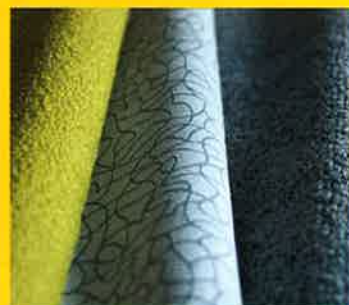
Luna Textiles 10-106 lunatextiles.com