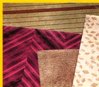
Wolf-Gordon 10-161 wolf-gordon.com