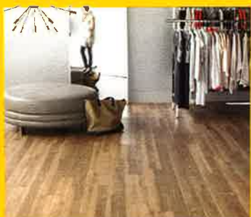
Patcraft 10-160 patcraft.com