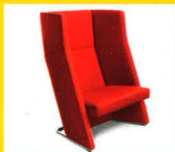
Keilhauer 373 keilhauer.com