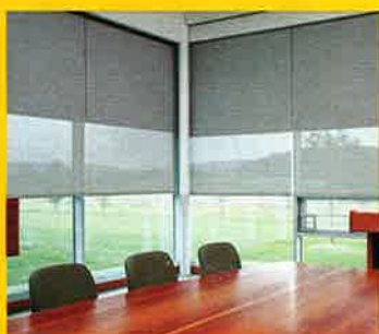
MechoSystems 8-5129 mechosystems.com