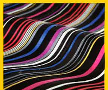
Momentum Textiles 11-106 memosamples.com