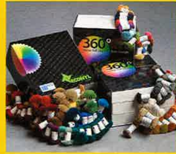
Aquafil USA 11-107 aquafilusa.com