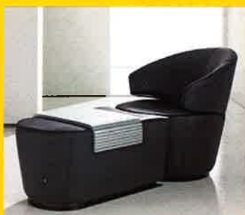
Paul Brayton Designs 8-3094 paulbraytondesigns.com