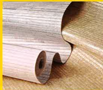
Innovations 629-A innovationsusa.com