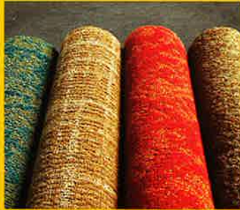
Bentley Prince Street 1060 bentleyprincestreet.com