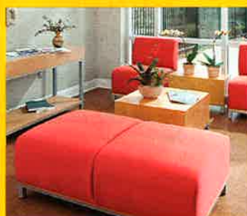
Sunbrella® Fabrics 8-8041 sunbrellacontract.com