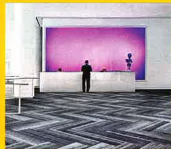
Interface 10-121 interface.com