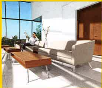
Global - The Total Office 1035 globaltotaloffice.com