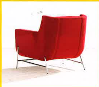
HBF 387 hbf.com