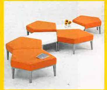
Arcadia 340 arcadiacontract.com