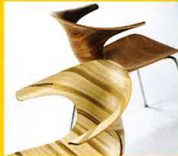
Community 3-111 communityfurniture.com