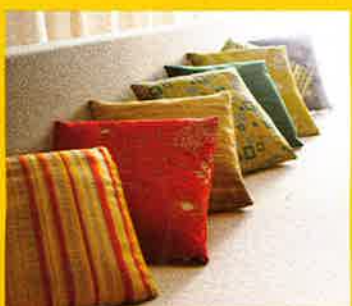
Mayer Fabrics 10-128 mayerfabrics.com