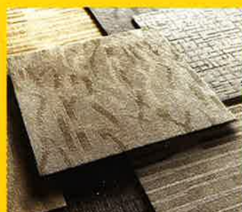
The Mohawk Group 3-121/377 mohawkgroup.com