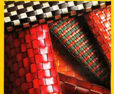
Garrett 8-6086 garrettleather.com