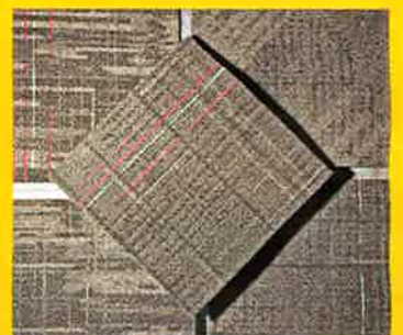
Mannington Commercial 1039 manningtoncommercial.com