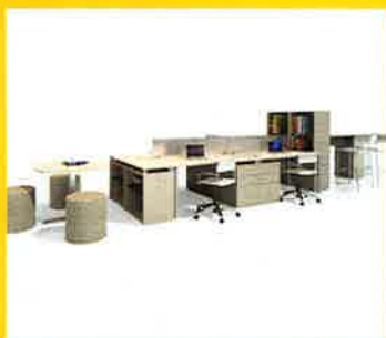
JSI 3-111 jsifurniture.com