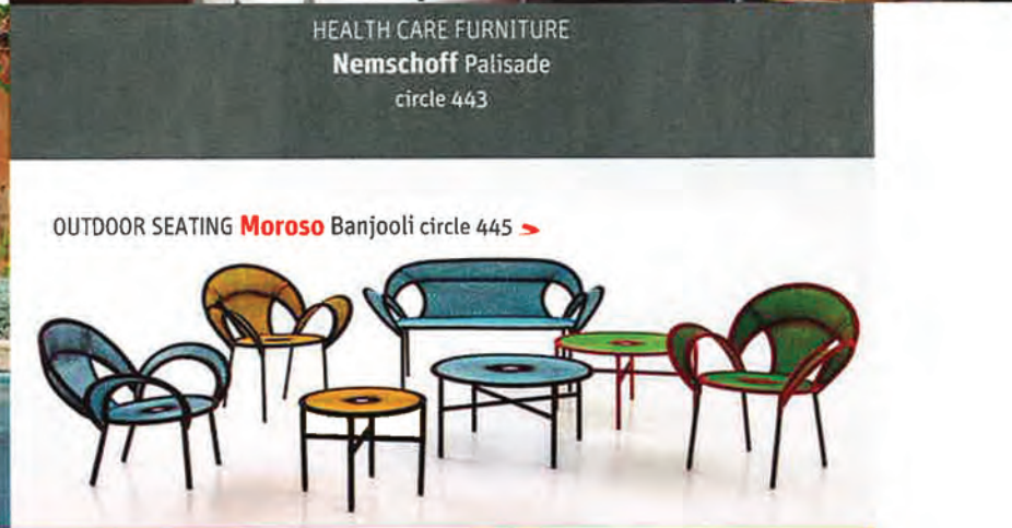
OUTDOOR SEATING Moroso Banjooli circle 445 >