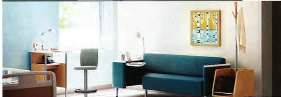
HEALTH CARE FURNITURE Nemschoff Palisade circle 443