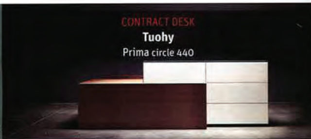
CONTRACT DESK Tuohy Prima circle 440