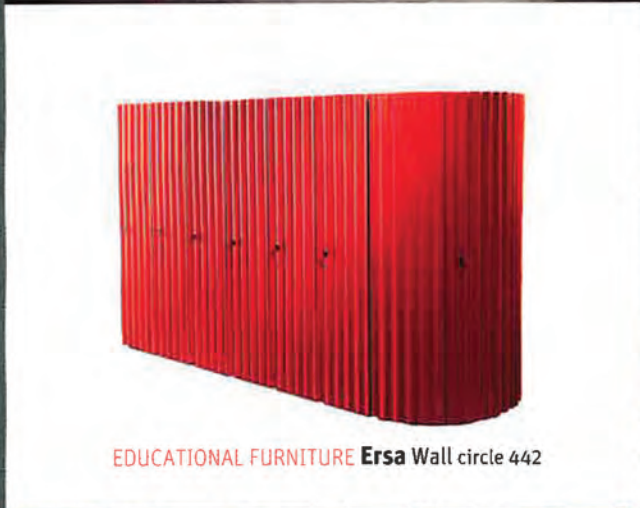
EDUCATIONAL FURNITURE Ersa Wall circle 442