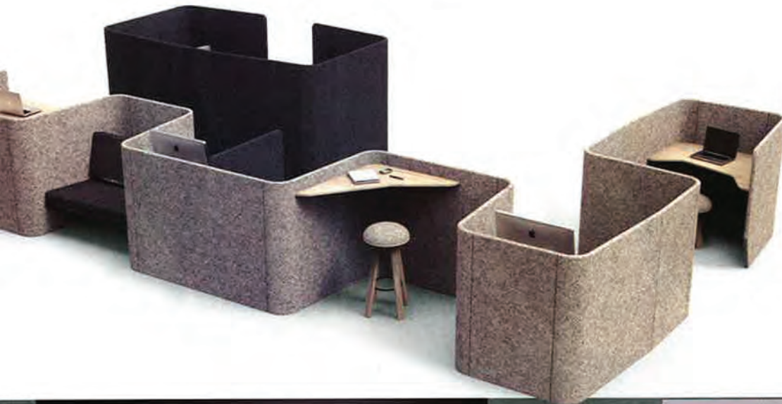
CONTRACT SYSTEM BuzziSpace BuzziVille circle 439