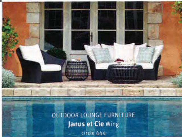
OUTDOOR LOUNGE FURNITURE Janus et Cie Wing circle 444