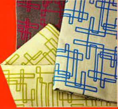
D.L. Couch 11-113