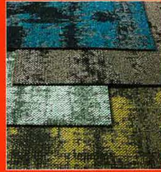
Tandus Centiva 391