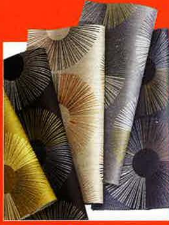
C.F. Stinson, Inc. 10-150