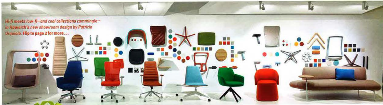
Hi-fi meets low-fi—and cool collections commingle—in Haworth's new showroom design by Patricia Urquiola. Flip to page 2 for more...