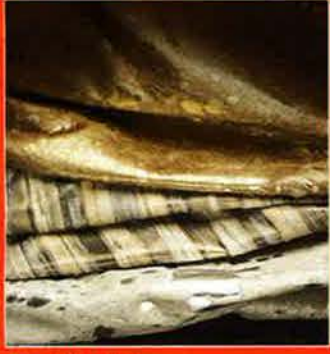
Garrett Leather 8-4118