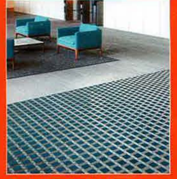
Construction Specialties Inc. 8-4103