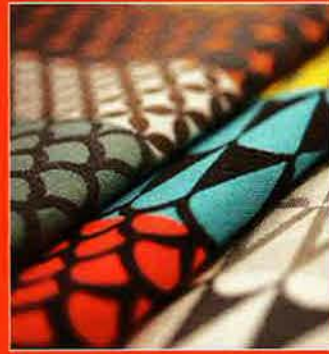
Sunbrella Contract 7-6042