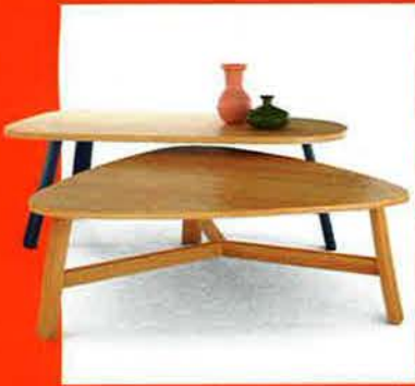
OFS Brands 1132