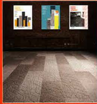
Mannington Commercial 1039