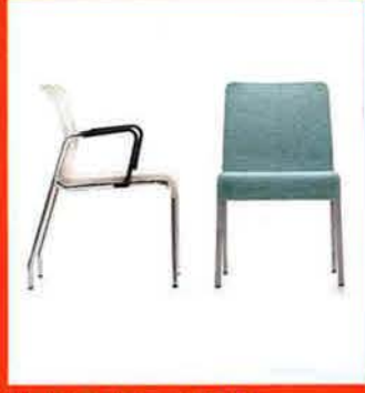
Global - The Total Office 1035