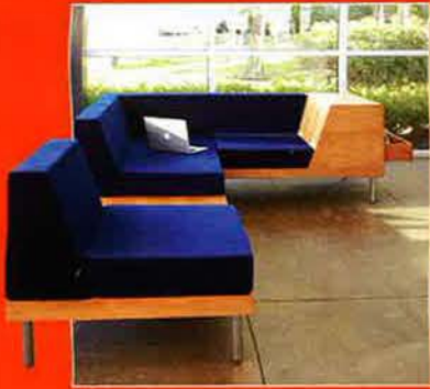
JANUS et Cie 3-107 & 1420