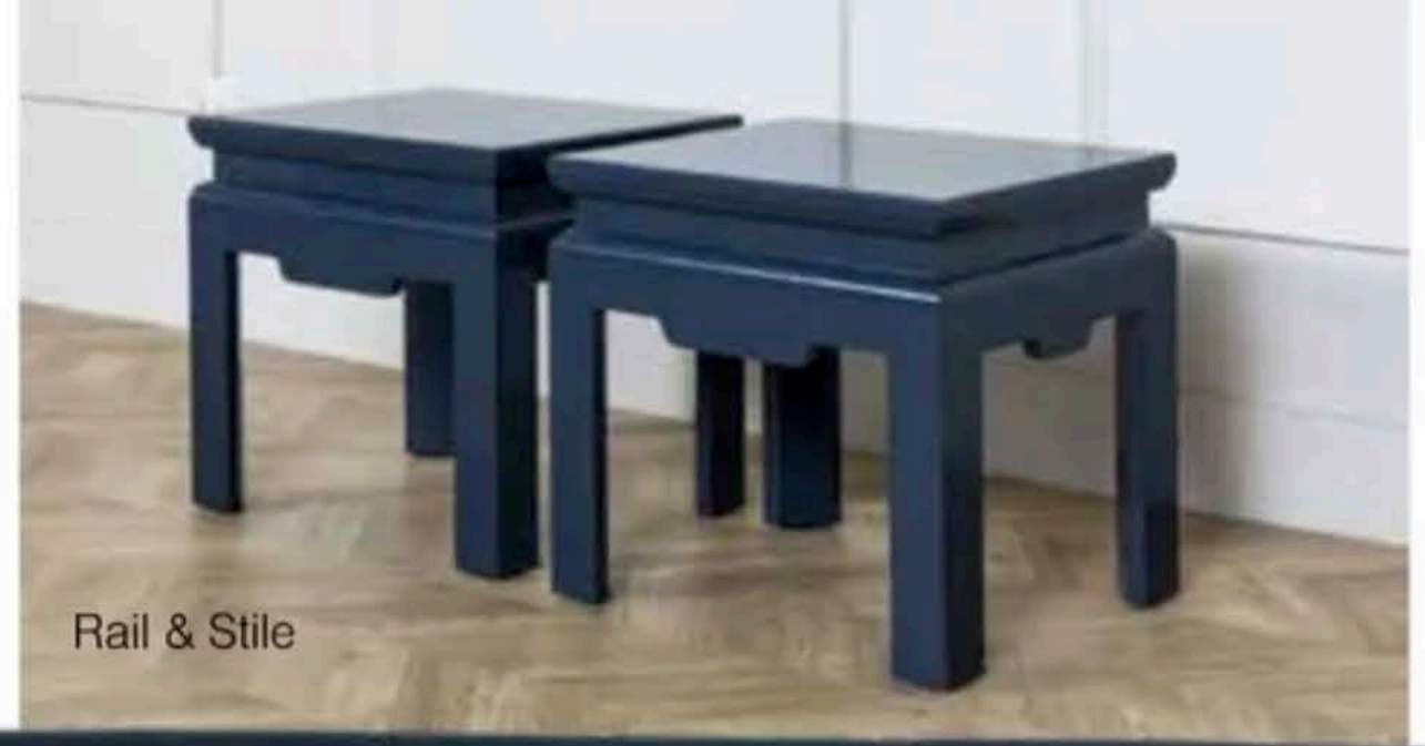
Rail & Stile