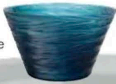
Janus et Cie