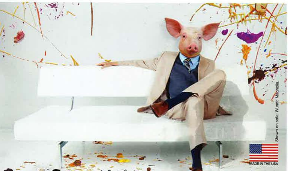
Shown on sofa: Wundt, Magnolia.

Because Sometimes we can all be a little ..