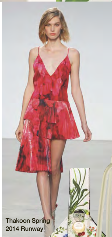
Thakoon Spring 2014 Runway

Kim Seybert Garden of Eden runner ($630). Sue Fisher King, San Francisco, 888.811.7276.