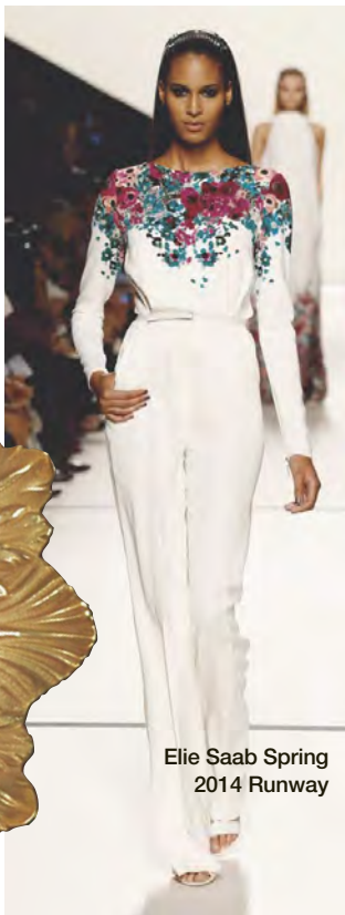
Elie Saab Spring 2014 Runway

Osbourne & Little Kashan Stripe fabric and Howard Hodgkin Large Flower Peony Fabric. Available to the trade at Osbourne & Little, San Francisco Design Center, 415.255.8987.