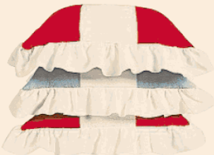
► Jumbo Stripe reversible towel cushion by Matilda Goad & Co £65 Easily washable and equally suited to the pool, garden or bathroom armchair. matildagoad.com

Outdoor living | Immerse yourself in the holiday vibe with beautiful accessories, selected by Roddy Clarke