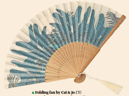
▲ Folding fan by Cai & Jo £10 Keep a breeze on your face with this satin and bamboo creation. A must-have for your poolside tote. caianjo.com