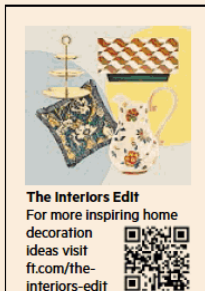
The Interiors Edit For more inspiring home decoration ideas visit ft.com/the-interiors-edit