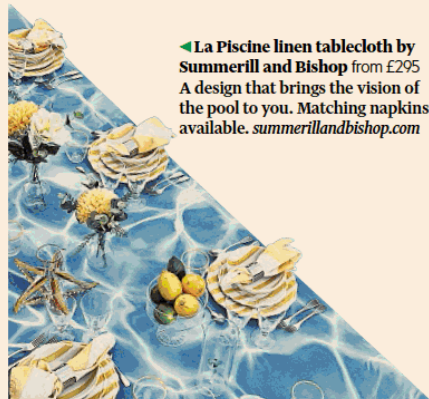
◀ La Piscine linen tablecloth by Summerill and Bishop from £295 A design that brings the vision of the pool to you. Matching napkins available. summerillandbishop.com