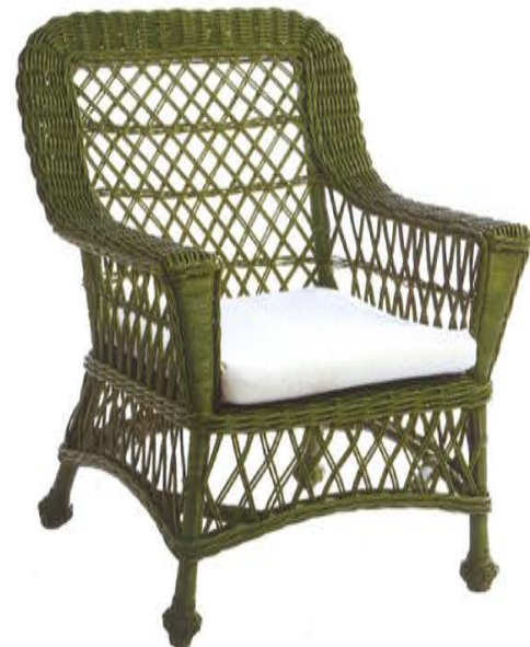
Straight out of Sister Parish's handbook, this green-painted, traditional silhouette looks just right indoors. Montauk Arm Chair , $500, scoutandhumble.com