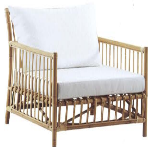
A sleek silhouette and an airy disposition make this clubby lounge anything but square. Caroline Lounge Chair , $1,090, sikadesignusa.com