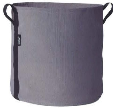
Lightweight, innovative fabric creates a topiary tote that steals its looks from your favorite bag. Batyline Plant Pot, $98, bacsac.com

3. TREE HUGGERS Consider it a migratory pattern: These containers are so good-looking, you'll want to make their move indoors permanent. Oversized, artful and bearing no resemblance to their garden variety terra-cotta cousins, they're ideally sized to hold an ornamental tree for a year-round breath of fresh air.