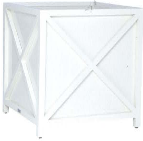
Powder-coated aluminum does wood one better in this perfectly pared-down box planter. Azimuth Cross Planter, $3,119, janusetcie.com