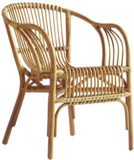
This bohemian model uses rattan reeds to maximal effect. Check out those curves! Pari Rattan Chair , $128, anthropologie.com