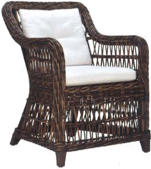
Great from every angle, this chair nods to Victorian forms, but clean lines make it work in modern settings, too. Arbor Armchair , from $1,259, janusetcie.com