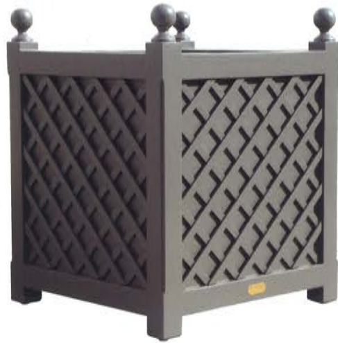
A texture that's always welcome: classic latticework, especially when combined with finials. Wood Treillage Planter, $1,950, accentsoffrance.com