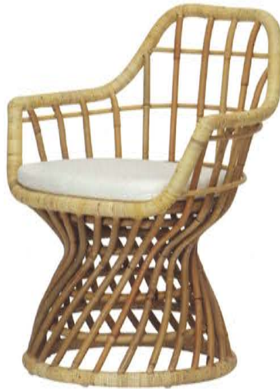
An elegant, spiraling base elevates this statuesque seat to dining-room-ready status. Lakeside Arm Chair , $623, selamatdesigns.com