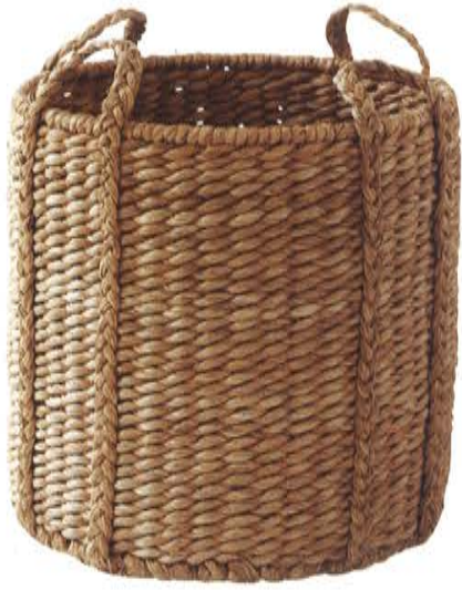
At two feet tall, this woven abaca number provides all the natural camouflage you need for tree roots (or toys). Lucid Abaca Basket, $630, fschumacher.com