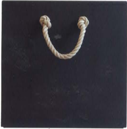
The knotted rope handles on this steel vessel prove that delight is in the details. Vineyard Planter, price upon request, formationsusa.com