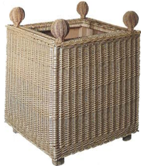
Woven by a French concern with a 150-year history, wicker puts a fresh spin on a classic Versailles planter. Vallabrégues Planter, price upon request, ateliervime.com