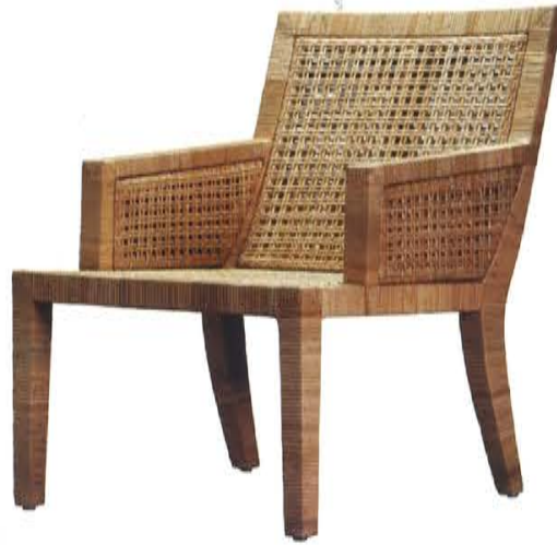
Sculptural and solidly minimalist, this Jean-Michel Frank design is handmade in France. Bergère Rattan 1930 Chair , from $2,020, theinvisiblecollection.com