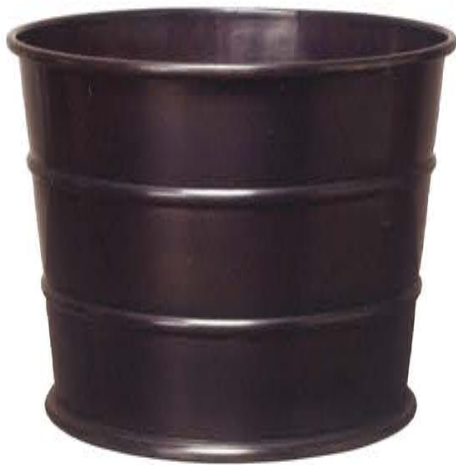
Made of copper and zinc, this artistically ringed specimen belongs on your fancy bucket list. Ribbed Planter, from $815, bronzino.co.uk