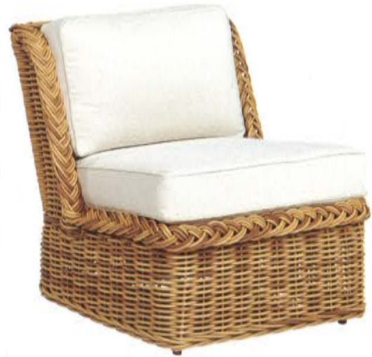
Lounge in the living room, not just by the pool, in this perfectly slouchy slipper chair alternative. Classic Armless Lounge , $2,228, thewickerworks.com