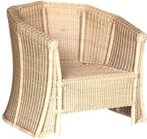
The surrealist-futuristic creations of unsung design hero Pierre Chareau inspired this supremely sculptural piece. Chareau #6 , $2,219, munder-skiles.com