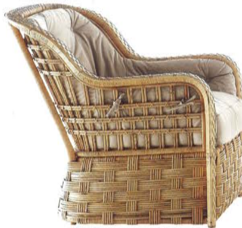
Renzo Mongiardino's sensuous Italian design plus sink-right-in tufting equals a textural treat. Crochet Carré Amchair , price upon request, bonacina1889.it