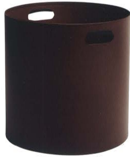
This industrial-chic looker is ingeniously perched atop four hidden casters for easy transport. Irony Outdoor Pot Planter by Maurizio Peregalli, $770, artemest.com