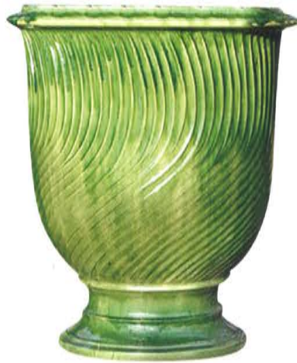
Produced in Provence, this glazed urn is a rhapsody en vert. Anduze Strie Vert Emaille Planter, $1580, authenticprovence.com