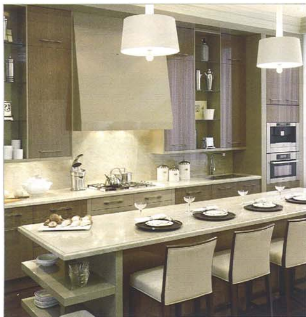
DOWNSVIEW KITCHENS, providing one of the largest selections of the latest surface materials available for the environmentally conscious consumer, recently added new imitation-wood finishes to its highly successful cabinet line Moda Xu. Dania Beach, 954/927-1100; Suite B-212