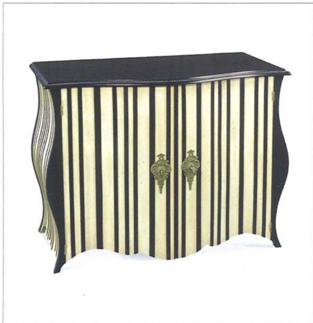
GRANGE FURNITURE, INC. introduces the Exceptions de Grange Collection, French-inspired occasional pieces that take traditional style and give it a contemporary twist with bold colors, textures and designs. Dania Beach, 954/925-8895; Suite C-400