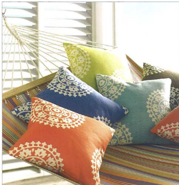
KRAVET, INC. combines beauty and the ultimate in durability with Kravet Soleil. Inside or out, this vibrant new fabric collection offers both extraordinary performance and style. Dania Beach, 954/920-4735; Suite B-180