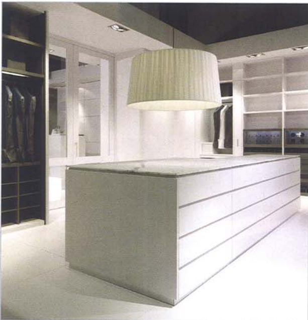
EGGERSMANN presents its sophisticated, German-made wardrobes and closet furniture for the home. Shown here is the S28 design in Icy White finish with Grigio veneer and Anthracite leather accents. And since it is all made to order, any combination of finishes and equipment is possible. Dania Beach, 954/342-4009; Suite C-262