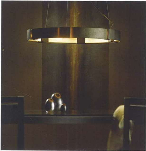
PPM COLLECTIONS presents a cable-hung ring of steel that encircles blocks of clear-cut glass with frosted glowing backs to create a captivating halo of light. Dania Beach, 954/342-8004; Suite A-328