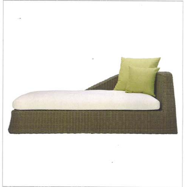
JANUS et Cie introduces the "Zeya Recamier," a stunning piece that exemplifies grace and glamour rendered in weather-resistant, hand-woven Generation-Next JANUSfiber™. Dania Beach, 954/923-3350; Suite A-123