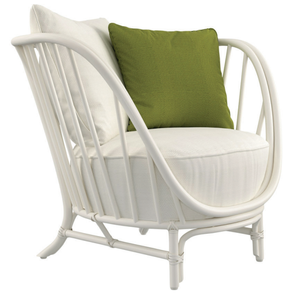
The Kyoto Alu Lounge Chair from Janus et Cie , is made from aluminum and the brand's proprietary Januscoat and Janusfiber. It is available in Limestone and Lava, and is suitable for indoors and out.