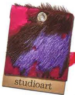
STUDIOART RODEO COLLECTION "HELP ME TO SAVE THE FASHION" COWHIDE (TO THE TRADE/DONGHIA)