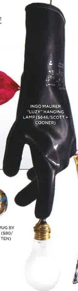
INGO MAURER "LUZY" HANGING LAMP ($646/SCOTT + COONER)