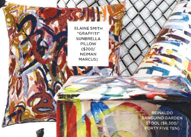
REINALDO SANGUINO GARDEN STOOL ($6,300/FORTY FIVE TEN)