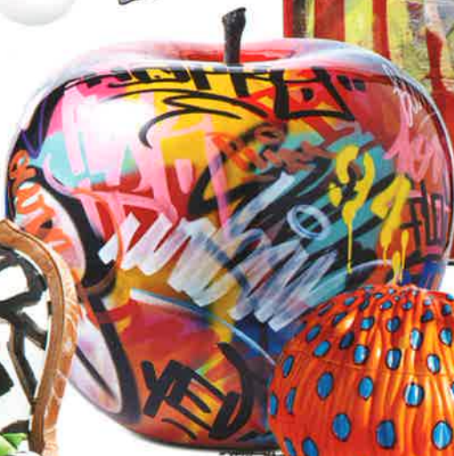
"EVE" GRAFFITI APPLE (TO THE TRADE/JANUS ET CIE)