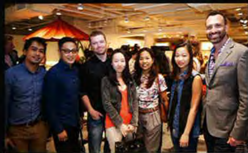
Team from EDG