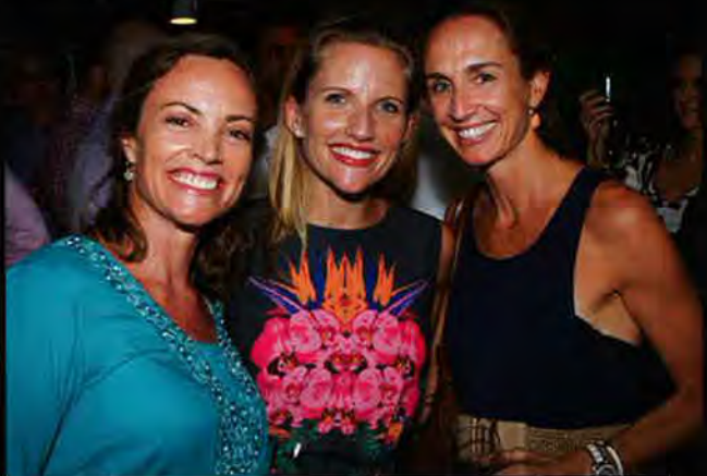
Guests of BW Furniture