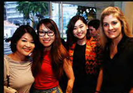
Team from Wilson & Associates