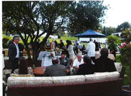
Customers gather outside the Lexington Home Brands showroom for the Tommy Bahama Outdoor Living party at Lexington's main showroom in nearby Thomasville.