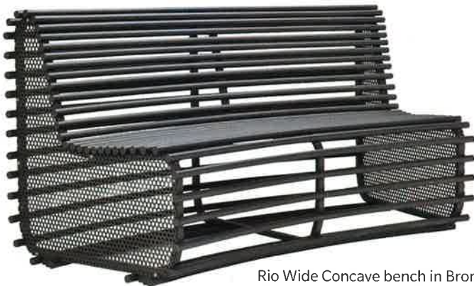
Rio Wide Concave bench in Bronze by Rios Clementi Hale Studios. Powder-coated aluminum. 33" h. x 74¼" w. x 35" d. $5,371. At Janus et Cie.