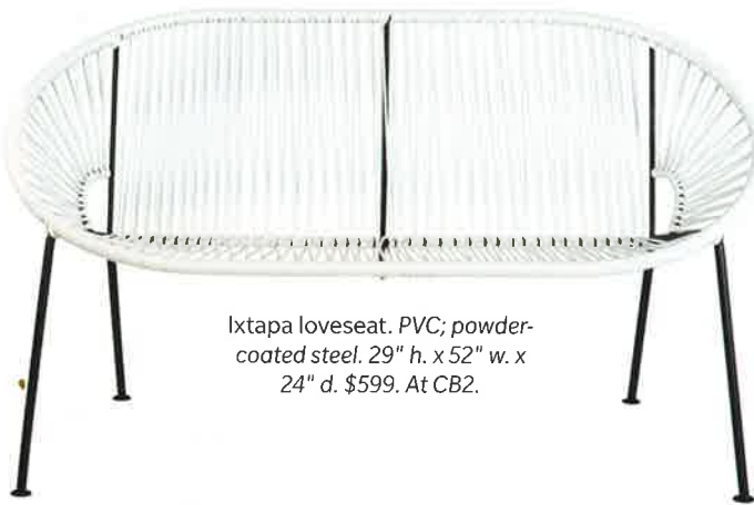
Ixtapa loveseat. PVC; powder-coated steel. 29" h. x 52" w. x 24" d. $599. At CB2.

This Acapulco-style bench has a modern Mexican vibe