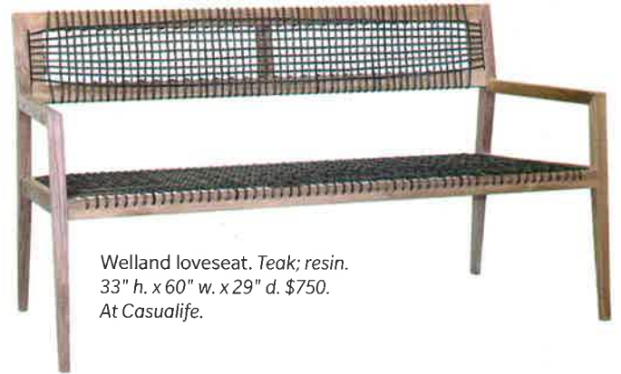
Welland loveseat. Teak; resin. 33" h. x 60" w. x 29" d. $750. At Casualife.