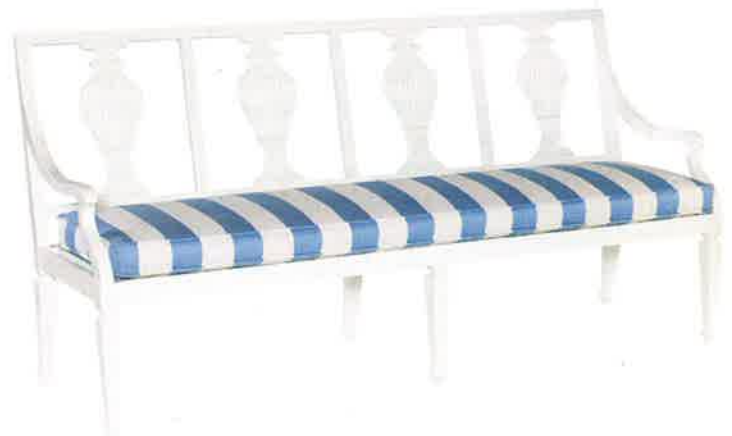
Swedish Garden bench in Cloud by Bunny Williams Home. Powder-coated aluminum; polyester; foam. 36" h. x 71½" w. x 24" d. $4,499. At The Art Shoppe.