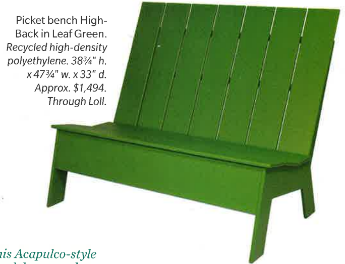
Picket bench High-Back in Leaf Green. Recycled high-density polyethylene. 38¾" h. x 47¾" w. x 33" d. Approx. $1,494. Through Loll.