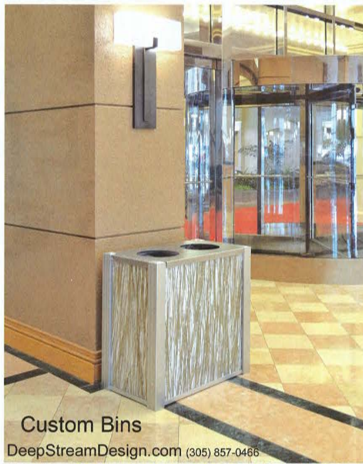
Custom Bins DeepStreamDesign.com (305) 857-0466

The winners are: Best of Show – Sandler Seating for overall innovation, quality and functionality of their new product lines for hospitality environments; 1 Accessories or Specialties – Rosenbaum for Luminescence; 2 Applied Finishes & Materials – Phillip Jeffries for Fade; 3 Architectural – Preciosa for Glass Wall; 4 Bath – Hansgrohe for Axor LampShower by Nendo; 5 Flooring – Shaw Hospitality Group for Noble Materials; 6 Furniture: Casegoods and Occasional – Sandler Seating for Nomado; 7 Furniture: Casual/ Outdoor – Janus et Cie for Strauss Armchair; 8 Lighting – Littman Brands Contract for Mikko; 9 Other – Applied Textiles for Alta; 10 Seating: Dining, Upholstered, Task, Banquet or Other – Sandler Seating for Quo; 11 Textiles – Concertex for EvoFabric Etched. ●