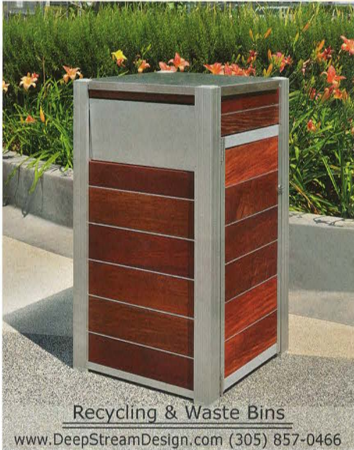
Recycling & Waste Bins www.DeepStreamDesign.com (305) 857-0466