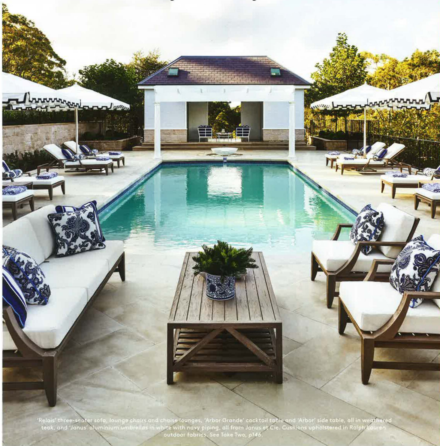
'Relais' three-seater sofa, lounge chairs and chaise lounges, 'Arbor Grande' cocktail table and 'Arbor' side table, all in weathered teak, and 'Janus' aluminium umbrellas in white with navy piping, all from Janus et Cie. Cushions upholstered in Ralph Lauren outdoor fabrics. See Take Two, p146.

Lush tropical gardens, dazzling azure outlooks and tree-lined cityscapes set the backdrop to this all-Australian line-up where inspiration abounds.