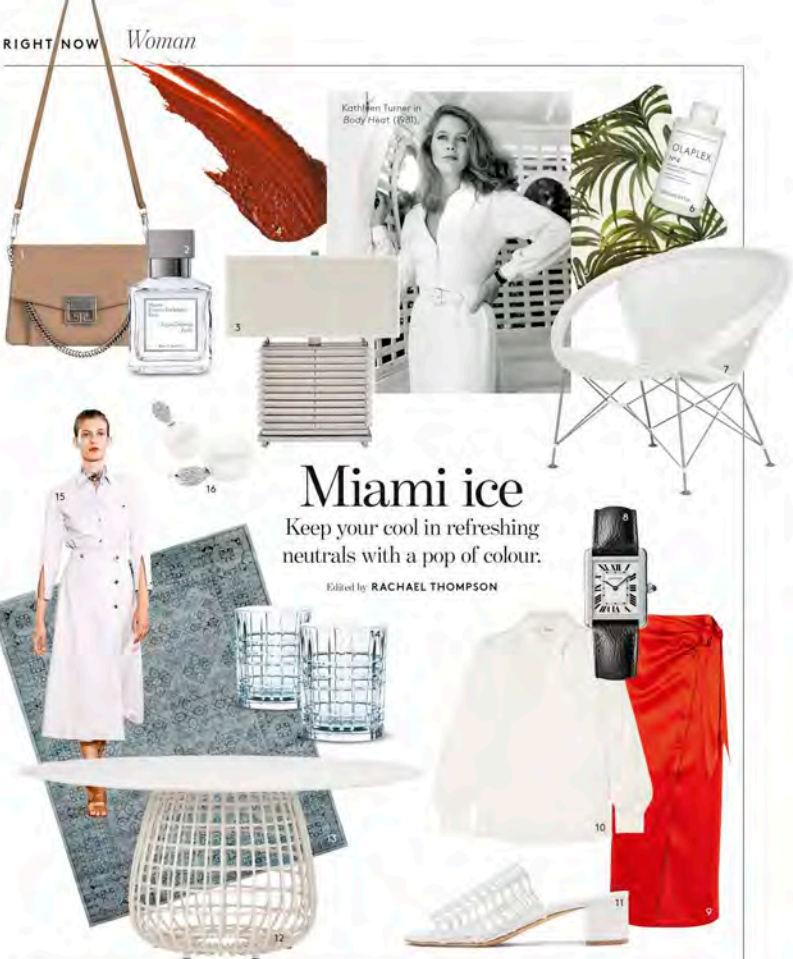
Kathleen Turner in Body Heat (1981).