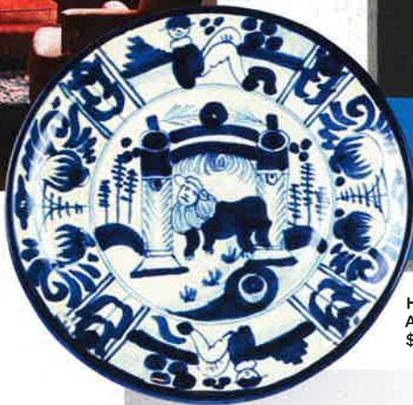
HAND-PAINTED MEXICAN BLUE-AND-WHITE DINNERWARE; FROM $48. MICHELLENUSSBAUMER.COM