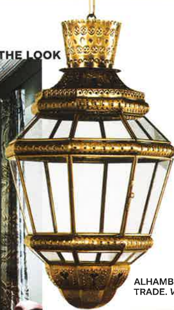
ALHAMBRA LANTERN; TO THE TRADE. VAUGHANDESIGNS.COM

“There’s no beauty without ugliness—it’s better when things are a little off.”