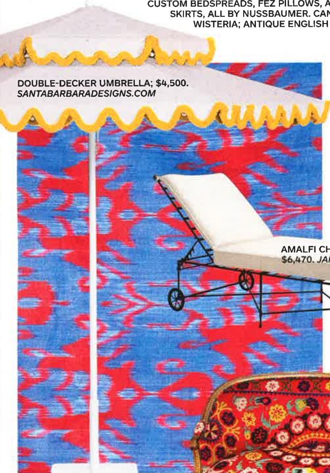
DOUBLE-DECKER UMBRELLA; $4,500. SANTABARBARADESIGNS.COM