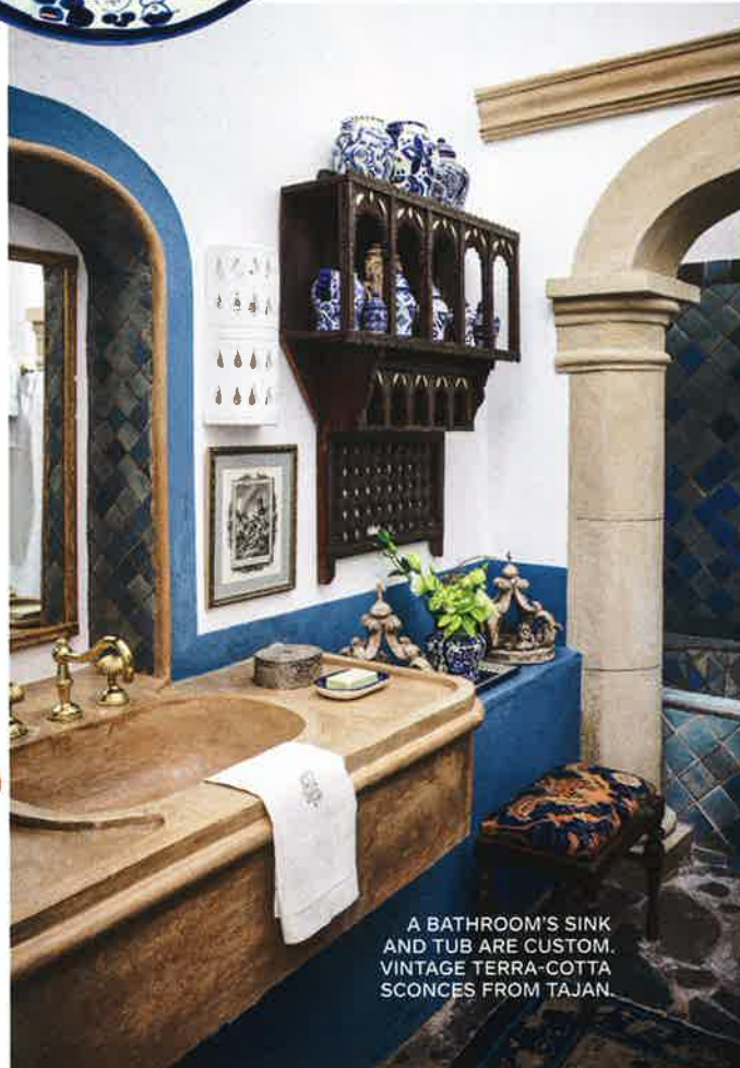
A BATHROOM’S SINK AND TUB ARE CUSTOM. VINTAGE TERRA-COTTA SCONCES FROM TAJAN.