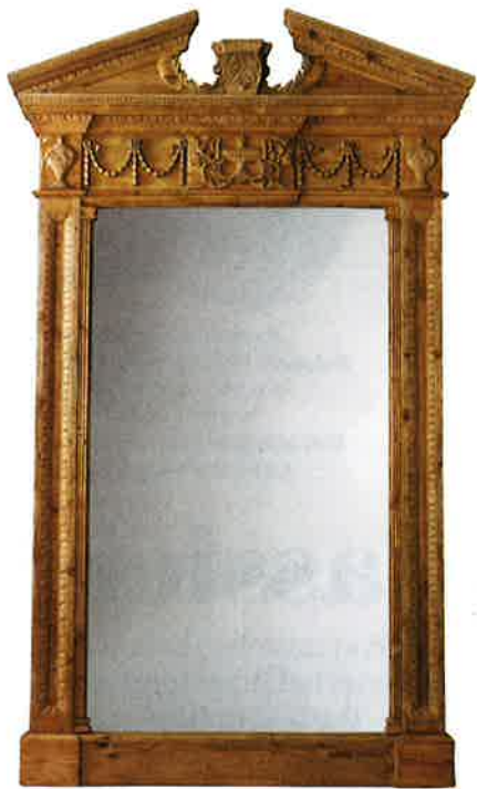
Pedimented and pilastered, RH's Entablature wood-framed mirror makes a grand statement. The eight-foot-tall version sells for $2,950. rh.com

A 19th-century photo of a London tube station sparked designer Michael Amato's 5'-h. Kensington pendant light for the Urban Electric Co. Pictured in hewn brass, it is offered in a variety of finishes; from $10,775. urbanelectricco.com