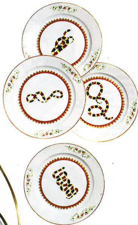
Beautiful but dangerous serpents are the intriguing central motif of designer Nick Olsen's hand-painted Snake porcelain dinner plates for de Gournay ; $450 each. degournay.com