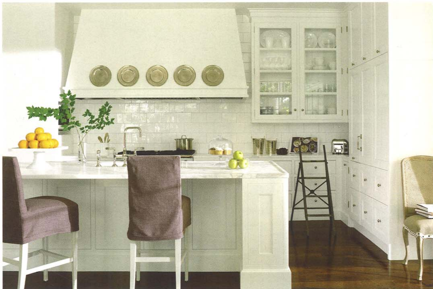
Above: Kasler-designed barstools for Hickory Chair stand at the kitchen island; the cabinetry is by Downsvew Kitchens, the sink fittings are by Michael S. Smith for Kallista, and the tile is by Waterworks. Below right: The kitchen's dining area features an antique Swedish pine table with Regency chairs; the pendant lights are by James Huniford Collection. Opposite, from top: The dining room is furnished with a table and chairs from Kasler's line for Hickory Chair; the room's dark-leather-clad chairs are vintage Jansen, the silver-plate punch bowl is by Ralph Lauren Home, the custom-made wall covering is by de Gournay, and the sisal is by Stark Carpet. Sofas by Janus et Cie and 1950s French woven chairs from the Nicholson Gallery beckon from the terrace; the sunburst mirror is vintage.