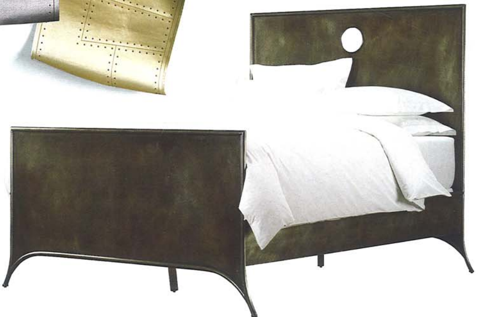
RUG: COURTESY OF ELSON & CO.; BED: COURTESY OF RESTORATION HARDWARE

A round cutout and flared legs add graceful curves to Restoration Hardware's 19th Century Keyhole bed, which is crafted of steel in a patinated finish. Prices start at $1,395 for a twin. restorationhardware.com , 800-762-1005