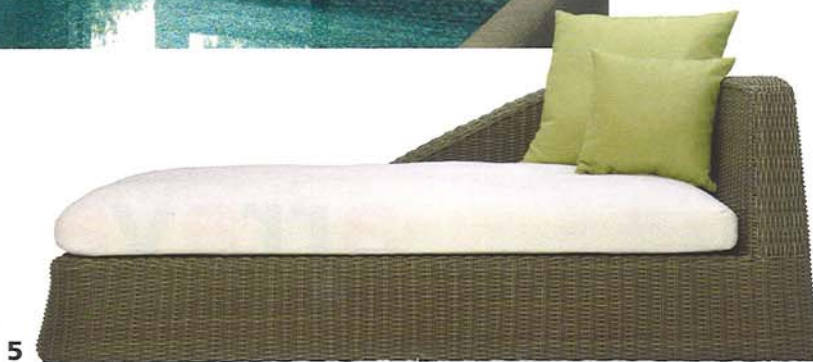
5. JANUS et Cie introduces the "Zeya Recamier," a stunning piece that exemplifies both grace and glamour rendered in weather-resistant, hand-woven Generation-Next JANUSfiber™. Miami Beach, 305/438-0005; Dania Beach, 954/923-3350