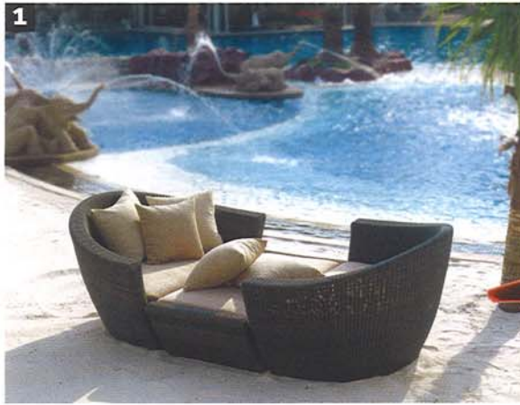
1. JUDITH NORMAN OUTDOOR LIVING features a wide array of styles suitable for all budgets. Shown here is "Canoe," outdoor seating by Veneman. Dania Beach, 954/925-7200