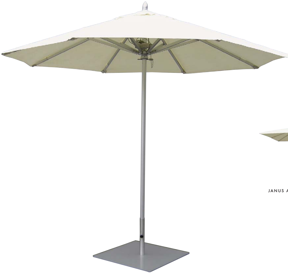
JANUS ALUMINUM ROUND UMBRELLA