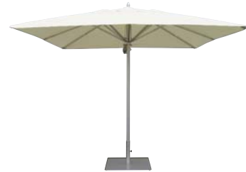
JANUS ALUMINUM SQUARE UMBRELLA