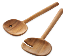
WHAT'S THE SCOOP Clio two-piece serving set $14.95/Crate and Barrel