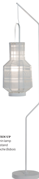
LIGHTEN UP Mandarin lamp with stand $2,250/Roche Bobois