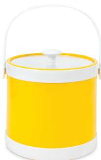
CHILL OUT Yellow ice bucket $32/Jonathan Adler