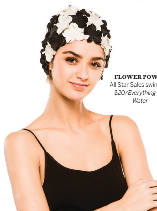
FLOWER POWER All Star Sales swim cap $20/Everything But Water