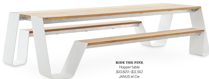
RIDE THE PINE Hopper table $10,820–$11,912 JANUS et Cie

THE AMBIENCE: Take a swim through the '60s with a retro-chic poolside bash. The water won't be the only thing keeping you cool when you prep your patio with fresh, white furniture and citrus-inspired accessories.