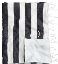
SELF ABSORBED Nine Space beach towel $76/J.Crew