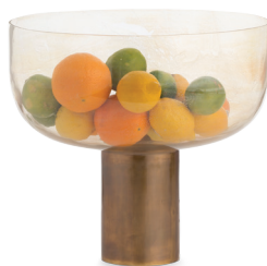
PARTY A-PEEL Heather bowl $510/Arteriors