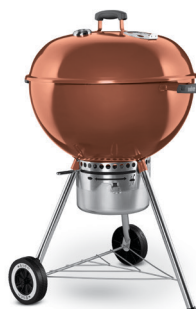
HOT STUFF Weber One-Touch charcoal grill $149/The Home Depot