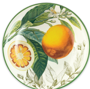
LEMON AID Botanical Citrus Dinnerware From $45/Williams-Sonoma